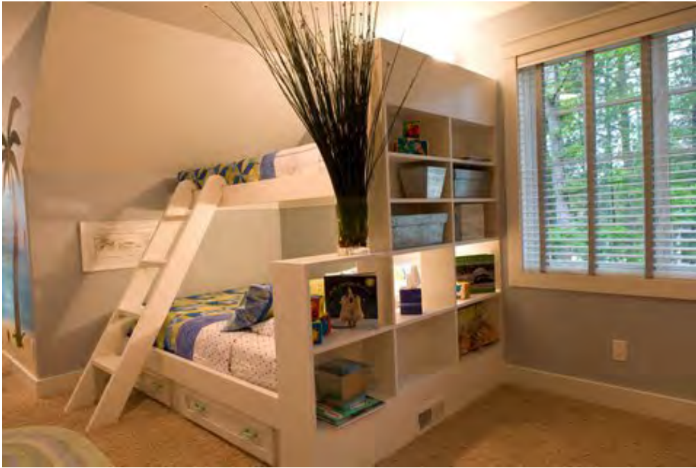
And this is one great room for a toddler boy.