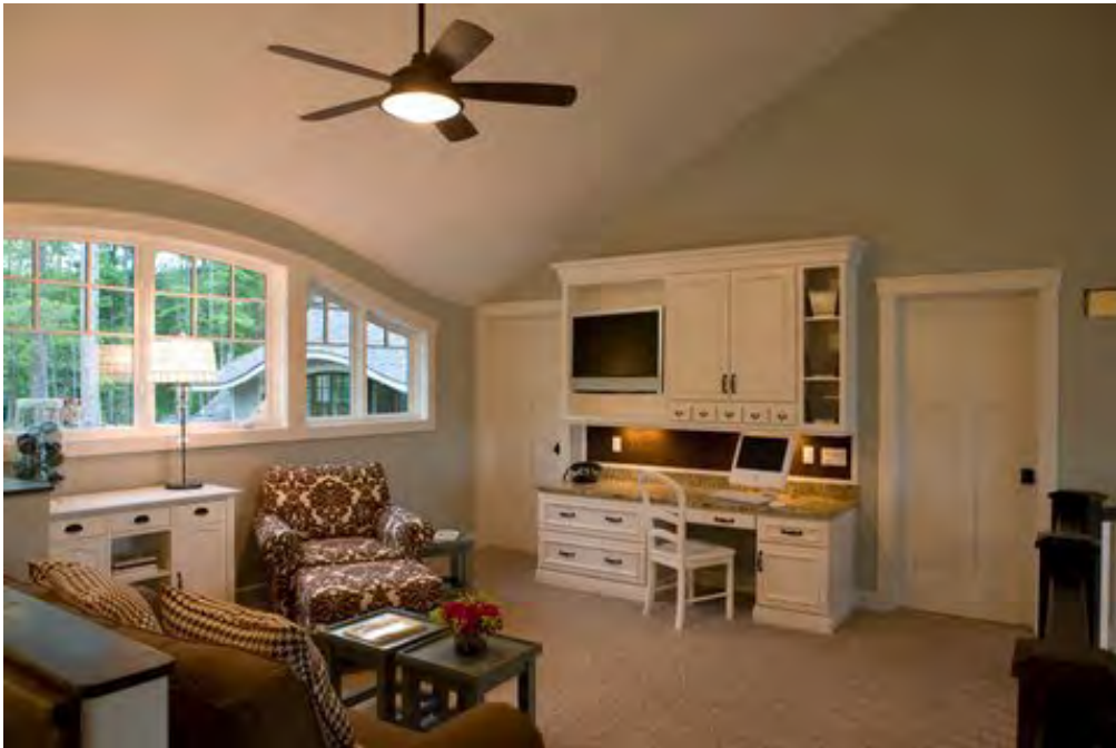
Love this workspace/sitting area at the top of the stairs... which looks down onto this...